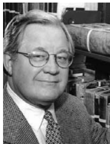
Walter B. Shurden

in Baptist History, Golden Gate Baptist Theological Seminary Pacific Northwest Campus